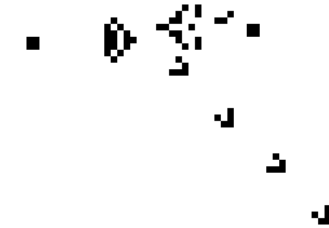
Figure 12.9: ... in action.